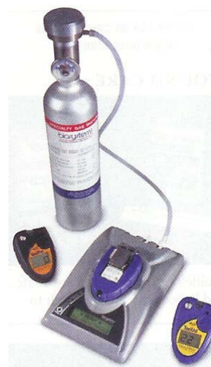
IQ Express Station

IQ Express bump test and calibration station